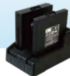
2-bay Battery Charger