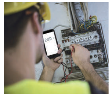
Electric Power Inspection